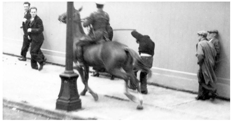
ABOVE: A mounted police officer clubs a man during the 'Battle of Ballantyne Pier' in Vancouver, June 18, 1935.

The Vancouver Police used tear gas, procured from a supplier in the United States after a demonstration in