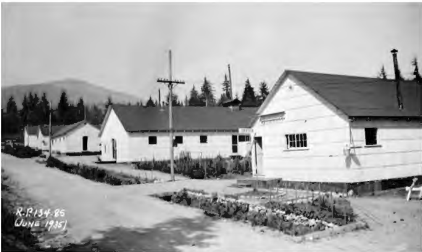
“A View of the Camp”.

By the end of the Project, 18,000 cubic yards of material had been excavated and placed as fill between the firing points. (Brig MacDonald to DND July 27, 1936) The fill was often described as “solid rock” and “hard pan”. This is in addition to land clearing, camp construction and road building that was undertaken. The monthly reports also itemized the cost savings