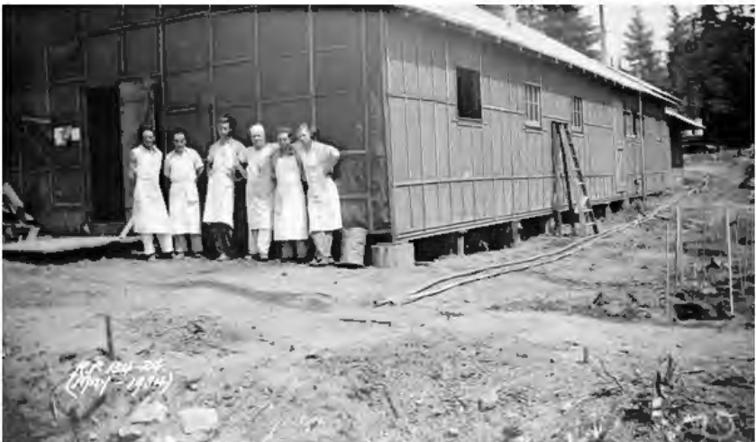
“Diner with [kitchen] crew”, May 1934