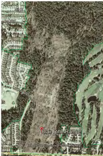
2009 Google Earth image.

The Blair Rifle Range Unemployment Relief Camp