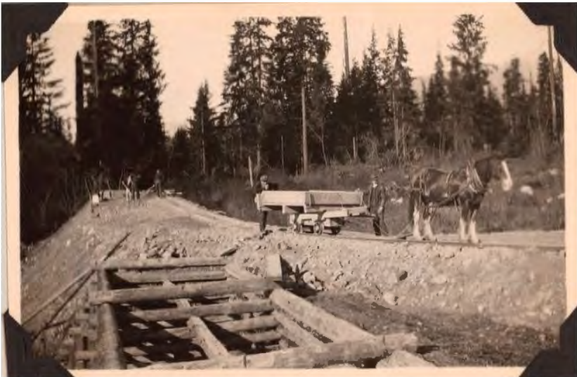
"Fill on west end of 600 yd F.P." Photograph appended to Works Progress Report, Blair Rifle Range at North Vancouver, February 28, 1935.

Initially, the Blair Rifle Range Camp workers were housed in the Competitors Building until the first camp accommodation was completed. General Ashton was optimistic in January 1934 that the project would be complete by September, but as the Depression wore on, so did the Rifle Range Project. The first task was to build a new road and begin clearing and construction of buildings. Despite heavy rain in March 1934, General Ashton reported that "good progress has been made on the new roadway, and also on the construction of the camp. Work on the grading further up the Range will be commenced this month."