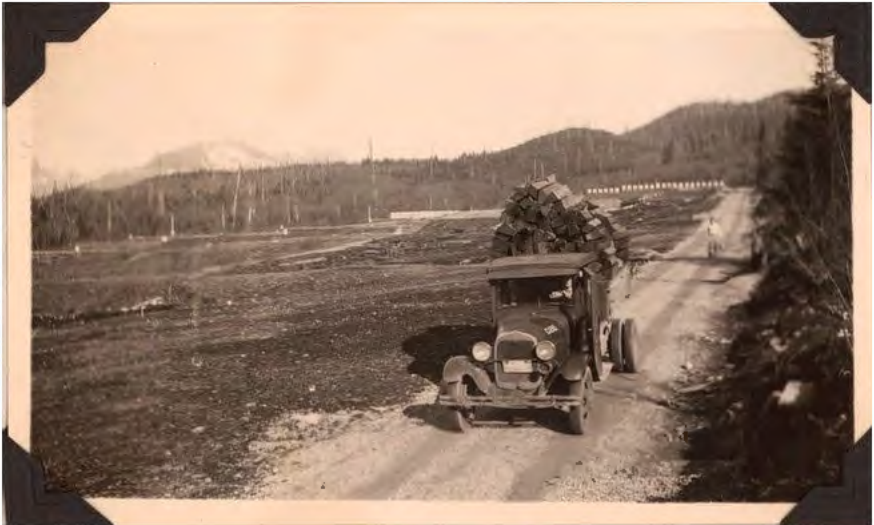
“Hauling firewood with truck” , Photo appended to Works Progress Report, Blair Rifle Range at North Vancouver February 28, 1935. Library and Ar-

In April 1934, Ashton reported, “the new roadway has been cleared throughout the length of the Range, and grading is in progress”. Ashton also noted the camp construction program was complete.