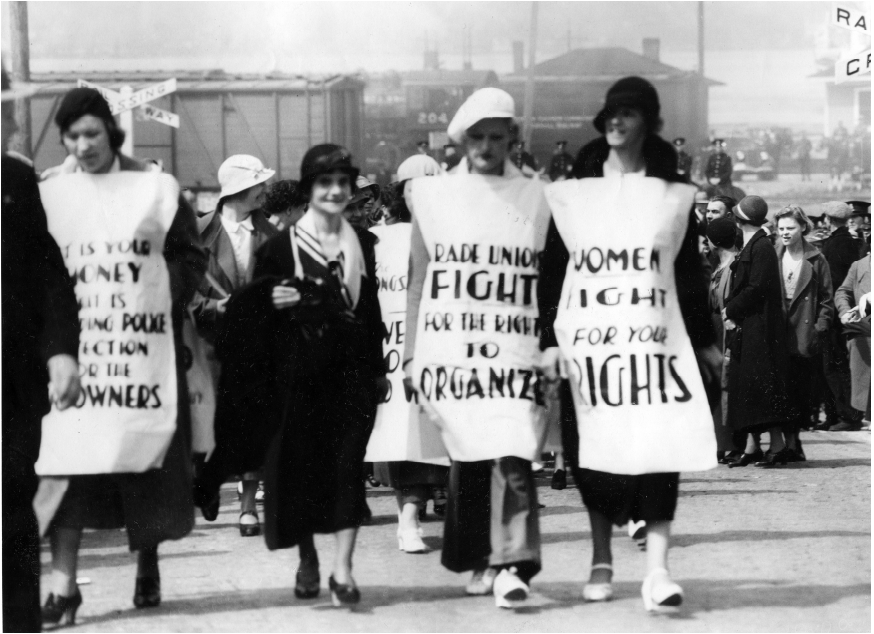
ABOVE: Women march in support of longshoremen, June 13, 1935, five days before the March on Ballantyne Pier.

support by fundraising, marching in the streets with strike banners and joined picket lines in defiance of Police Chief Foster's edict. While a large group of women were picketing near the waterfront on one occasion in September, they were confronted by police threats, rough handling and even the appearance of Chief Foster. They refused to move.(38)