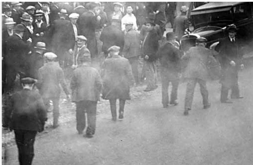
ABOVE: Tear gas used on bystanders, City of Vancouver Archives, CVA 371-1132.