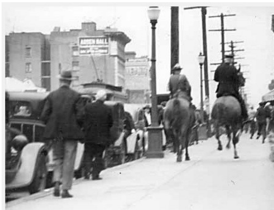
ABOVE: A group of police as if on parade.