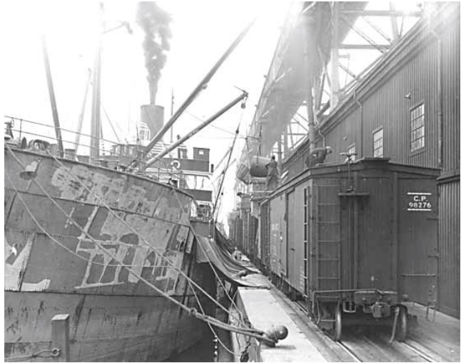
ABOVE: Unloading corn

Most of the 900 dockers that joined them were family men, owning or