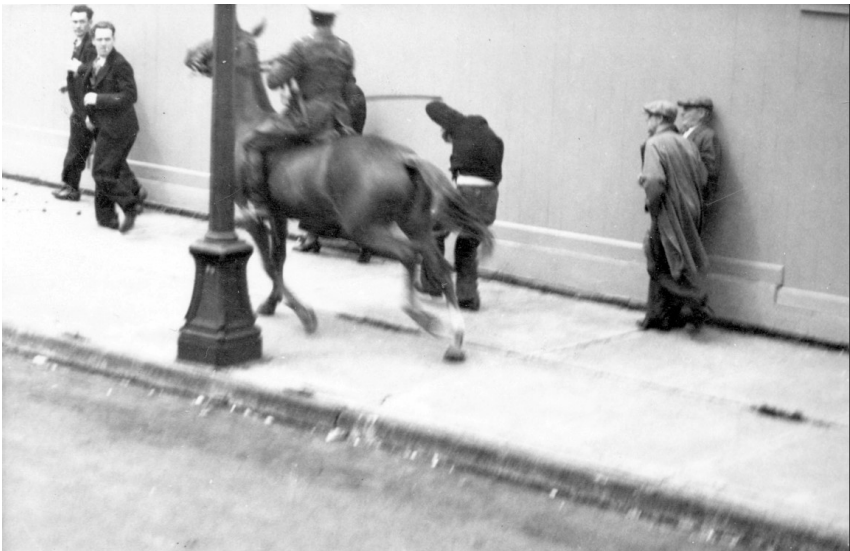
ABOVE: A mounted police clubs a man, City of Vancouver Archives, CVA 371-1129.

Fedoras and caps lay scattered along the tracks. Stones