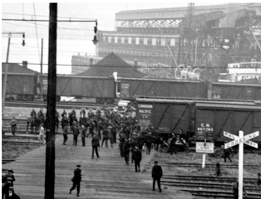
ABOVE: Police gather at the foot of Heatley Street to keep union dock workers away . Vancouver Public Library, 8828

Twenty mounted city police and 50 more on foot stood in line formation guarding the covered cargo entrance. Alongside them were three-dozen mounted RCMP, some in sniper positions with machine guns and 40 provincial police with billy clubs.