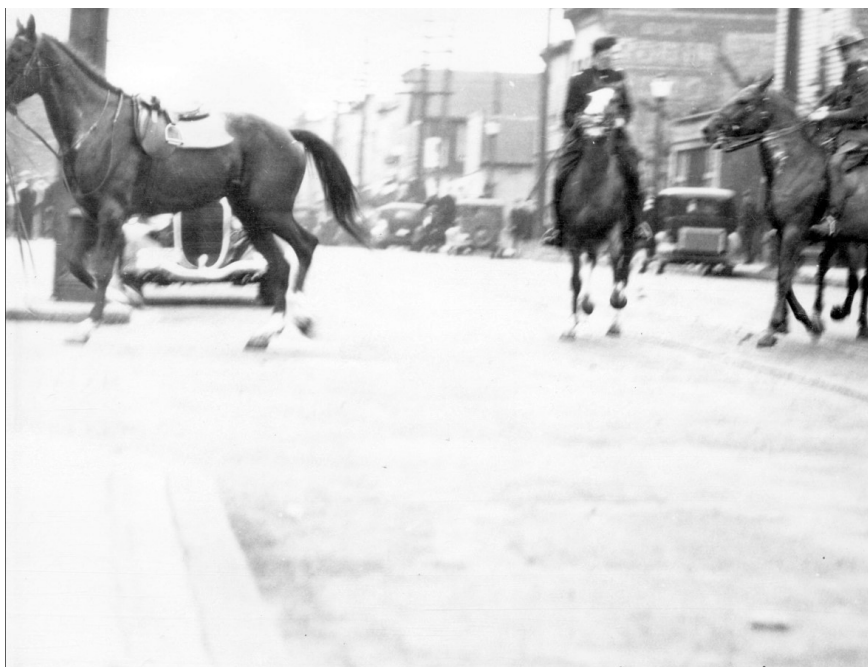
ABOVE: A horse, cut and bruised by the stone-throwing, galloped riderless back to the police stables.