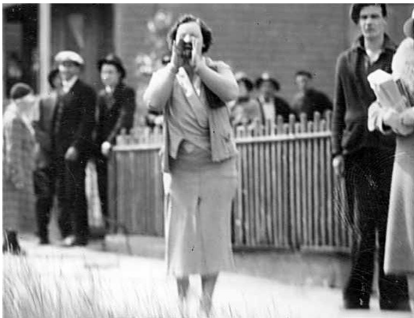
ABOVE: A woman shouts at police.

An elderly woman was shopping for eggs when a policeman told her to get off the sidewalk. When she refused, he hit her with his crop. Injured, she made her way to a vegetable store and waited for an ambulance.