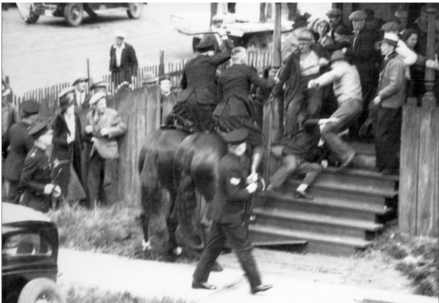
ABOVE: Police attacking crowd