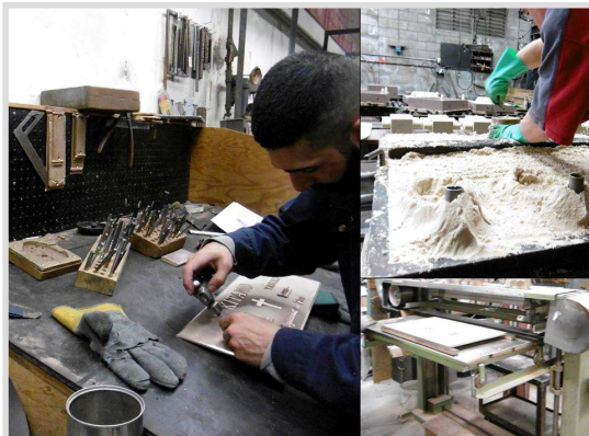
Highly-skilled members of Ironworkers Local 712 work on our plaques.

Our plaques are 28" x 19" and are cast in bronze for longevity.