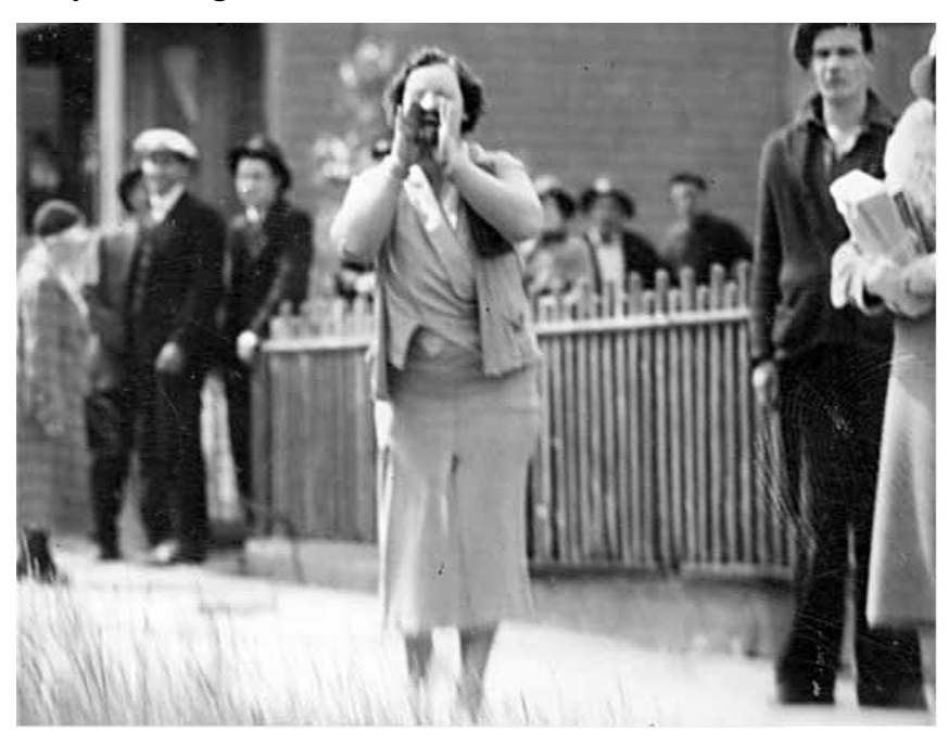
ABOVE: A woman shouts at police.

An elderly woman was shopping for eggs when a policeman told her to get off the sidewalk. When she refused, he hit her with his crop. Injured, she made her way to a vegetable store and waited for an ambulance.