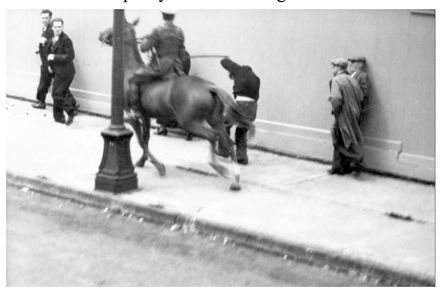
ABOVE: A mounted police clubs a man, City of Vancouver Archives, CVA 371-1129.

Fedoras and caps lay scattered along the tracks. Stones