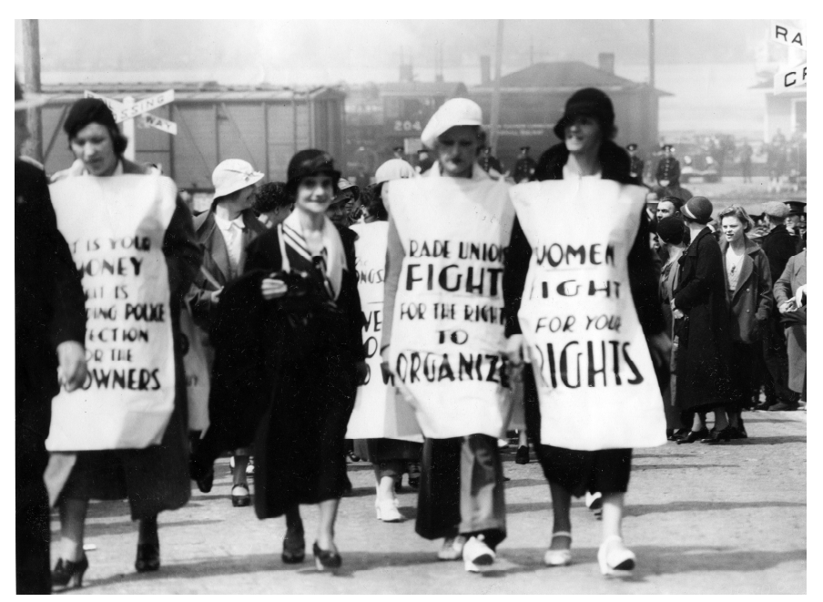
ABOVE: Women march in support of longshoremen, June 13, 1935, five days before the March on Ballantyne Pier.

support by fundraising, marching in the streets with strike banners and joined picket lines in defiance of Police Chief Foster's edict. While a large group of women were picketing near the waterfront on one occasion in September, they were confronted by police threats, rough handling and even the appearance of Chief Foster. They refused to move.(38)