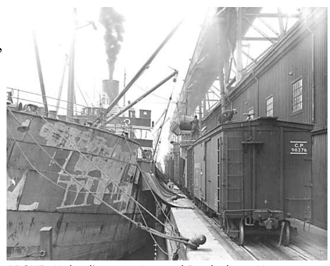
ABOVE: Unloading corn

Most of the 900 dockers that joined them were family men, owning or