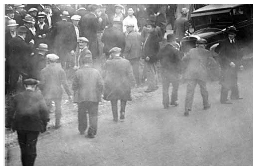
ABOVE: Tear gas used on bystanders, City of Vancouver Archives, CVA 371-1132.