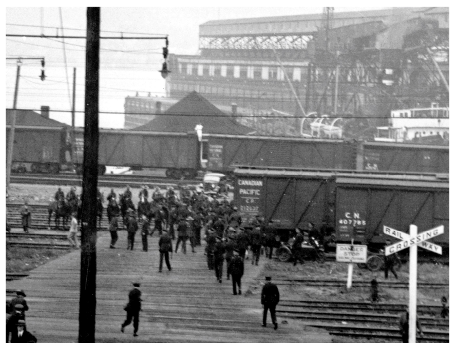
ABOVE: Police gather at the foot of Heatley Street to keep union dock workers away .

Twenty mounted city police and 50 more on foot stood in line formation guarding the covered cargo entrance. Alongside them were three-dozen mounted RCMP, some in sniper positions with machine guns and 40 provincial police with billy clubs.