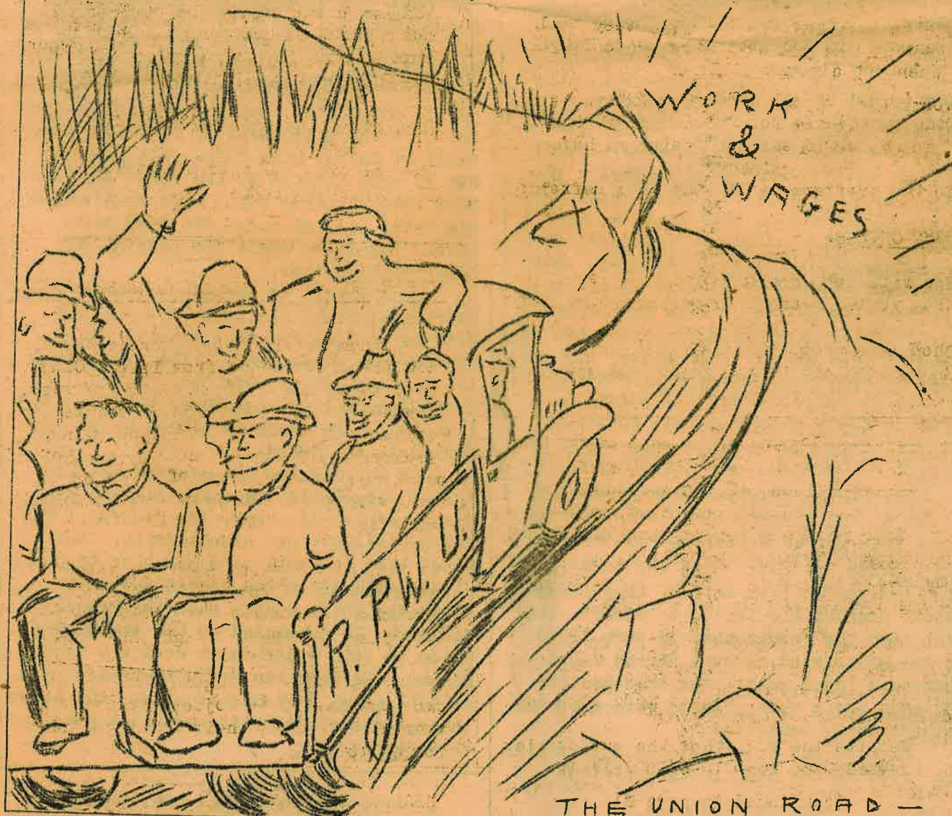
THE UNION ROAD —

This present scheme is the result of the organizational efforts of a comparatively weak organization; compared to what we can prepare, now on the Projects against the time we may face unemployment and starvation again. We can begin this ground work, by launching or renewing a drive to enroll into the Union, every worker on the projects. Membership in the Union is the very pivot about which organization rotates. Our goal must be a 100% Union. This will be our best answer to the authorities, should they manoeuvre to put us in the spot we were last summer. To build the Union is the work of every member. Let us start the drive now, and report a successful campaign that shows 100% in results.