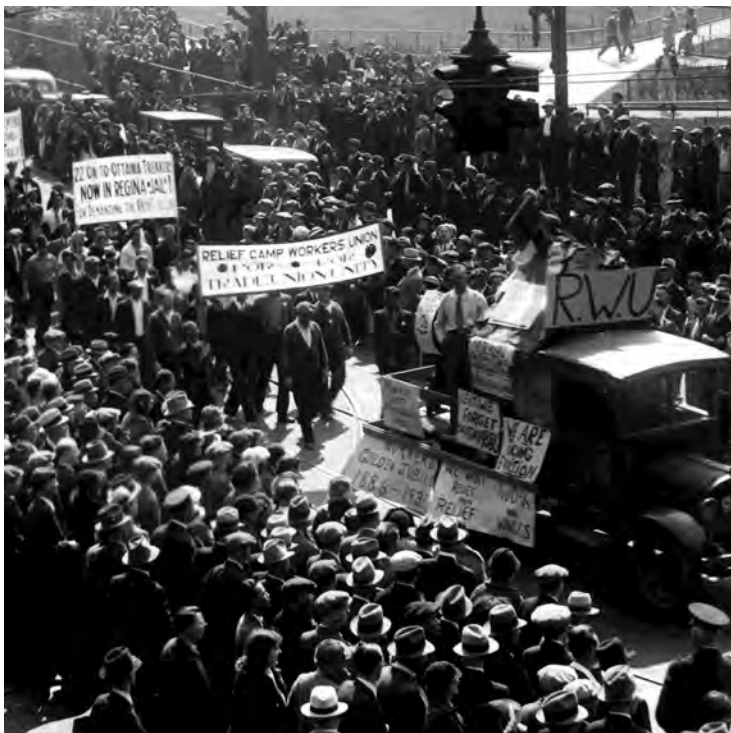
During the 1930s May Day parades and rallies drew crowds in large cities and in smaller towns around the BC. Vancouver Archives CVA 417-9.