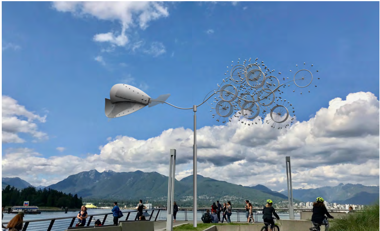
North America's first international monument honouring the victims of asbestos exposure will be erected this year. This multi-year project has been led by the BC Labour Heritage Centre.