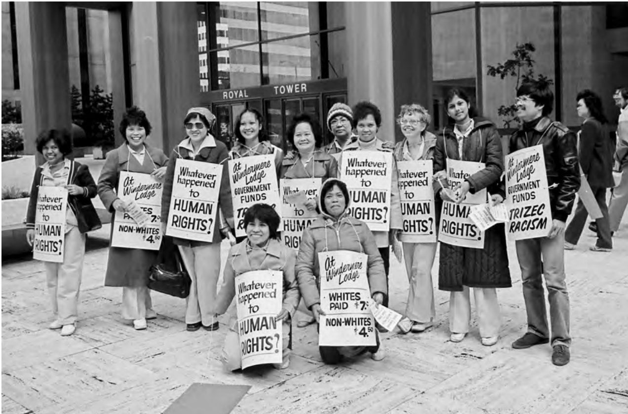
Striking members of the Hospital Employees' Union picketing the corporate offices of a private owner of long-term care facility in Vancouver in 1981. Worker solidarity was powerful in achieving better pay and rights at work.