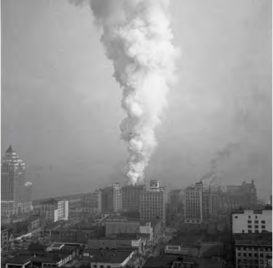
The Province newspaper, Vancouver Public Library 45866

Theories about the cause of the fire were suggested by some witnesses: sabotage, an incendiary bomb, spontaneous ignition, and friction. These were rejected on the spot. As for a cigarette, there was much evidence. The employers spoke of the